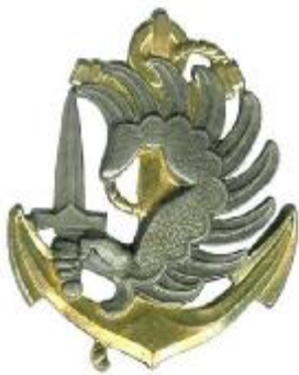
Beret insignia of colonial paratrooper