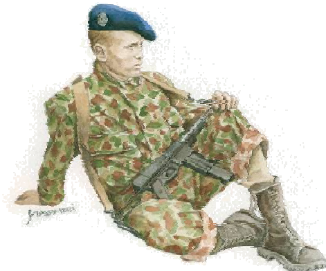
Para of the 10th BPCP - Indochina

Next the French Army regrouped all its Army Airborne regiments into two parachute divisions in 1956. The 10th parachute division – “ 10ème Division Parachutiste, 10ème DP ” - came under the command of General Jacques Massu and General Henri Sauvagnac took over the 25th Parachute Division – “ 25ème Division Parachutiste, 25e DP ”. Again the Commandos de l'Air were kept under command of the Air Force.