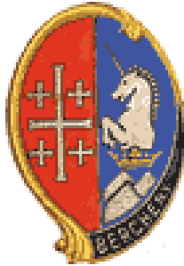
1 er RHP Airborne Cavalry