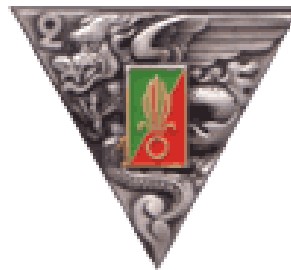
2 ème REP Airborne Legion