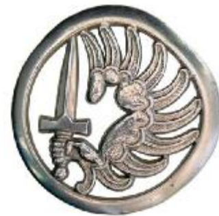
Beret insignia of metro paratrooper