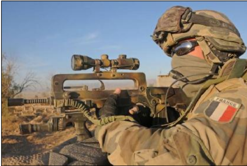
Para of 8e RPIMa in Afghanistan

In the aftermath of the Cold War , the French Army reorganised and the 11th Para Division became the 11th Parachute Brigade in 1999.