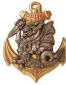
8 ème RPIMa Airborne Marines