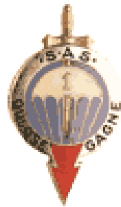
1 er RPIMa Airborne Marines