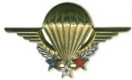
Free-fall instructor badge