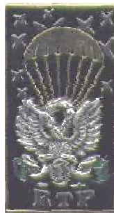
1 er RTP Airborne Air-delivery