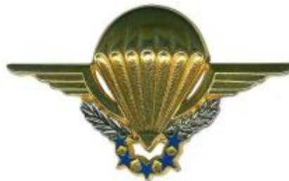
Free-fall para badge