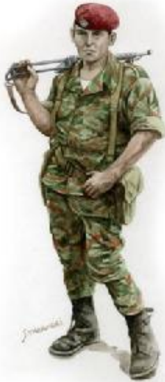
Para of the 3rd RCP

Netherlands on April 1945. The “ 1er Régiment Parachutiste de Choc ”, another very famous French airborne regiment, carried out operations in Provence.