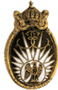
13 ème RDP Airborne Cavalry